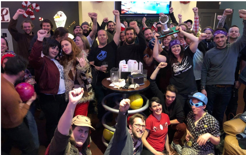
Participants in the Workers' Justice Cup event, 2019

For more information or to reserve your spot, contact Isabelle at isabelle@tapsbc.ca or 250-361-3521. ■